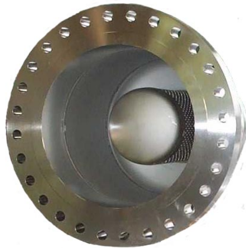
View into the interior of a Q.E.I. controlled-pressure diffuser from the downstream connection.